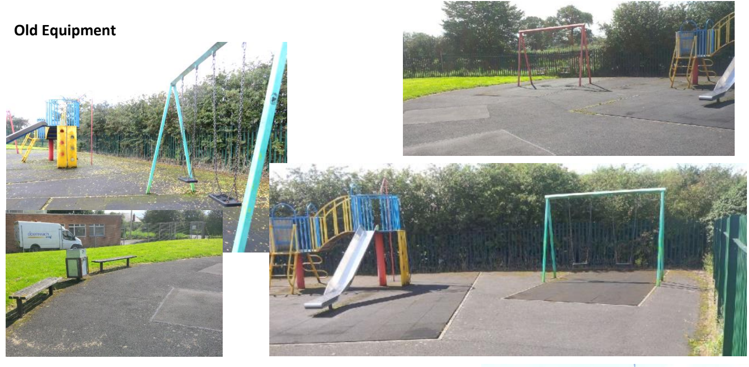
Replacing the Old Equipment

In January we placed an order for the new play equipment for the recently leased Summerfields play area, with Komplan. They had to remove the old equipment and then replace it with the new order. They began in January. They progressed quickly even through snow in February and it was opened in March 2018.