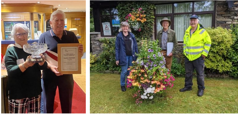
2021 Tourism awards – Carlisle Golf Club and Park Cliffe Caravan Park

planting. It is therefore worth entering our Tourism Awards. Even if all that you have is just a street side entrance, you will have room for some sort of display.